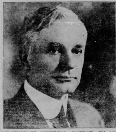
THE DEMOCRATIC REPUBLICAN CANDIDATE FOR 1928 CORDEHL HULL

Asked the question, the speaker with an optimistic viewpoint launches forth in an intelligent discussion pleasing to listen to. The pessimistic individual, who lives in a town because he has not enough gumption to move away, replies with a yowl that unmakes the otherwise strong heart.