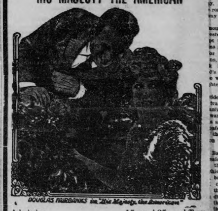
DOUGLAS FAIRBANKS in "His Majesty, the American"