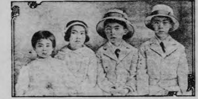
THE CHILDREN OF THE PHILIPPINE COMMISSIONER. The Baby of This Group Speaks Three Languages—Visayan, Spanish and English.