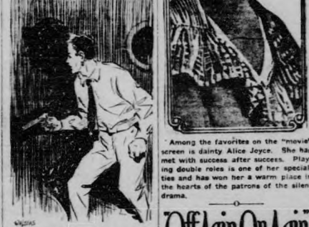
Among the favorites on the "movie" screen is dainty Alice Joyce.

mark. It missed. "The going on deck," he answered quietly. "They're too busy to notice me and besides it's dark. You will stay here and replace the barricade after I go out. We've got to know what's going on. Miss MacKay. The ship has been struck once, though not fatally. I think, but I don't know. It is no place to be caught in if another shot prove more successful. I will be back presently."