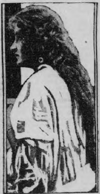
Good Hair Can Be the Possession of Every Woman.