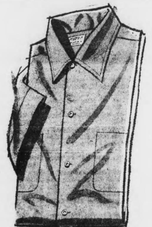
SPORT & KNIT

Be sure you do not miss this dazzling array of truly great values!