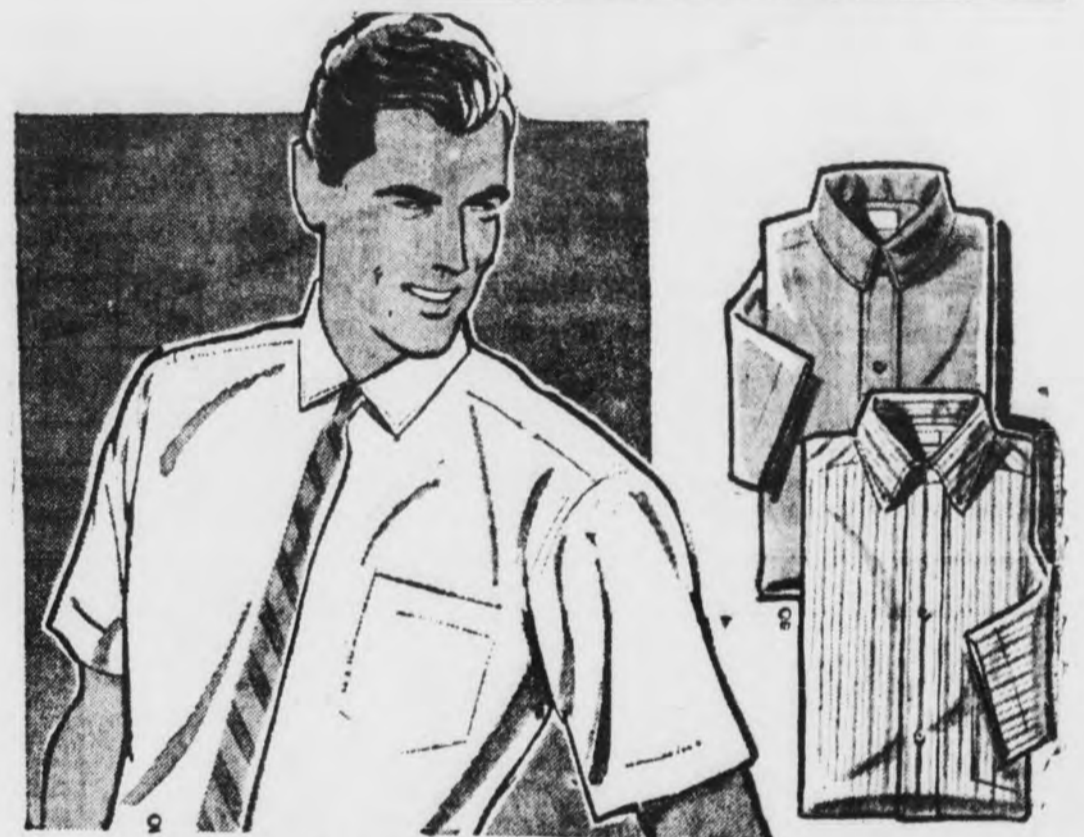
WHITE and COLORED, SHORT-SLEEVED

$65.00 Values $47 77 at anniversary time, yours for