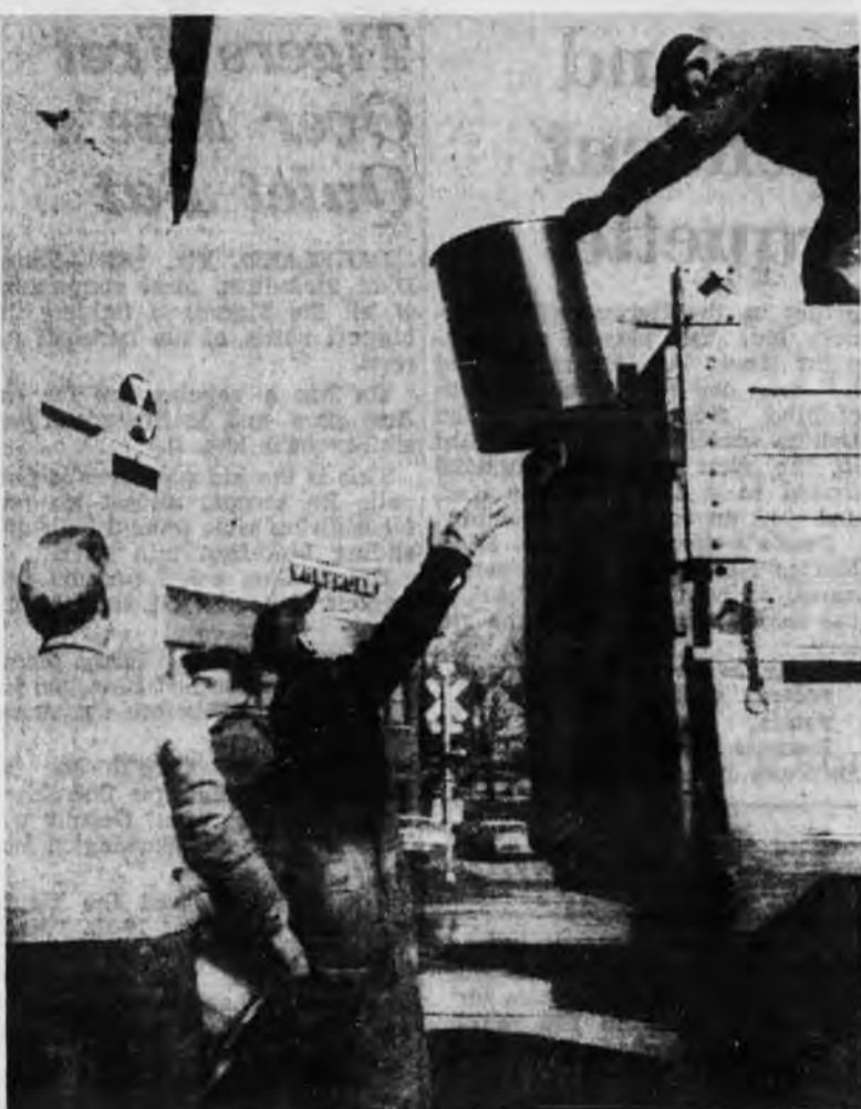
City workers unload a truckload of supplies at the Miners' First National Bank, a civil defense fallout shelter. The bank is able to house 77 persons in case of emergency.