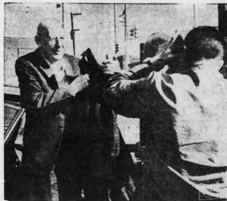
Robert Stroud, 73, known as the "Birdman of Alcatraz," shown arriving by car at U. S. District Court House in Kansas City where he appeared in hearing on complaint that prison officials have refused to let him publish further works on bird life.