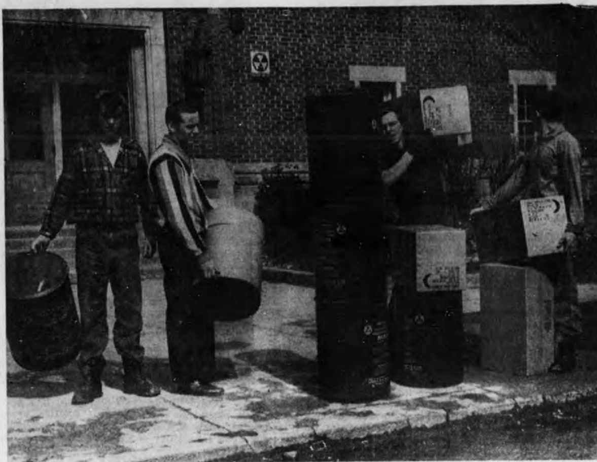
Volunteers are shown unloading civil defense supplies at the Graveraet building, one of the 29 buildings in Marquette approved as a public fallout shelter.