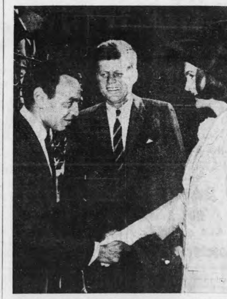
President and Mrs. Kennedy are shown greeting Morocco's King Hassan II as he arrived in Washington earlier this week. The King wound up an official three-day visit on Friday.