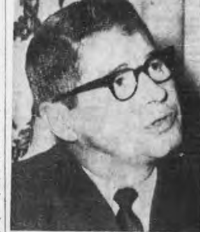
Secretary of Agriculture Orville L. Freeman cautioned the European Common Market today that barriers against U. S. farm exports could force a cut in American foreign aid and spread the "contagious virus of protectionism."

The United States and the Soviet Union have closed the U.N. book