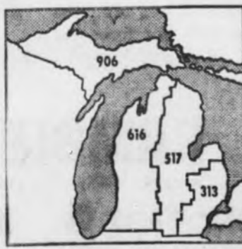
Michigan's four Area Codes. Other states have their own.

In the front of your new telephone directory you'll find a list of Area Codes. Each Area Code consists of three numerals and identifies a particular geographical area—either part of a state or an entire state.