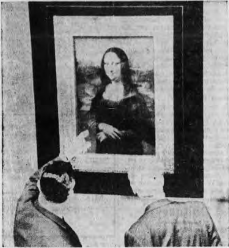
Here is the Mona Lisa, world's most famous portrait, which will go on display at the National Gallery in Washington for three weeks beginning today. Priceless painting will then be shown in New York and possibly other cities before going home to France.