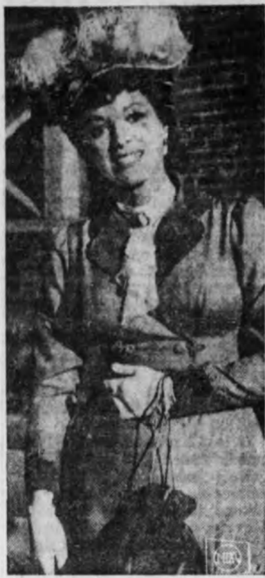
Gorgeous Maureen O'Hara, dressed in costume for "McLintock", has played in 48 films since her movie debut in 1939.

arch at the main entrance to the library, was enjoyed by both adults and children.