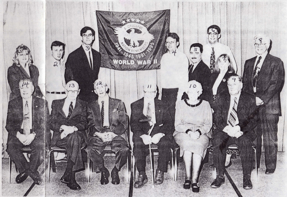
Labon April 1995. Students & authors of oral history of World War II.