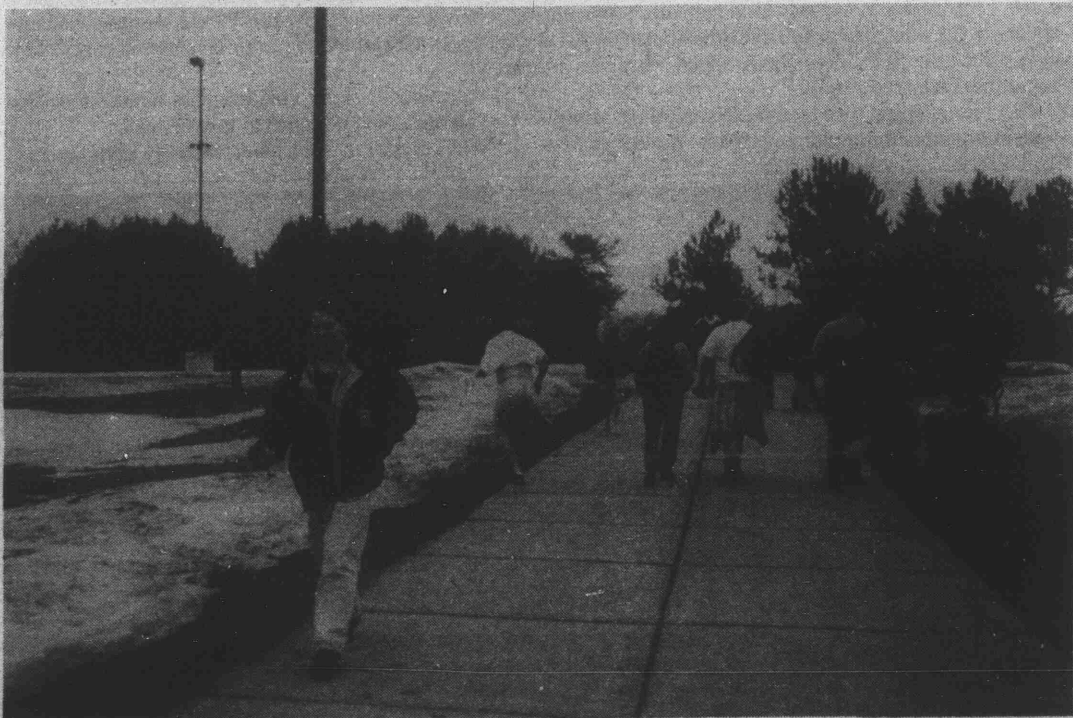
We always knew NMU students were crazy, but now we can see their nuts. The streakers, who were rumored to be members of the President's Council, were inadvertently caught in the act by an unsuspecting nursing class.