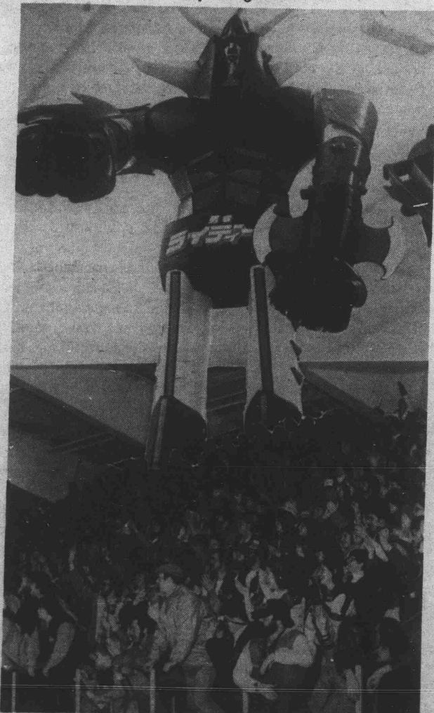
Forest Roberts Theater's newest prop awaits use in the spacious dome.