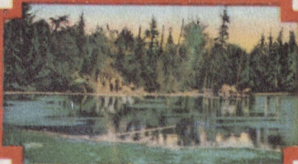
KITCH-ITI-KI-KI-PI, THE WONDER SPRING, SCHOOLCRAFT COUNTY