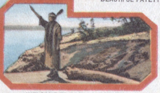
WELCOME TO BARAGA COUNTY