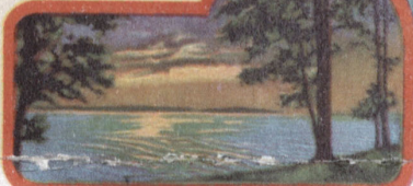
PRESQUE ISLE, MARQUETTE COUNTY