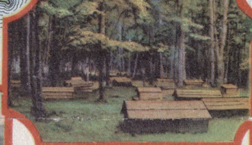
OJIBWAY INDIAN CEMETERY, CHICAUGON LAKE IRON COUNTY