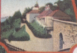
OLD FORT MACKINAC, MACKINAC COUNTY