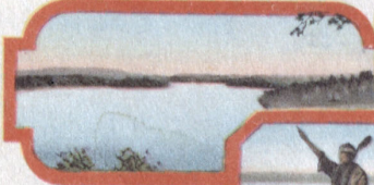
LAKE ANTOINE, DICKINSON COUNTY