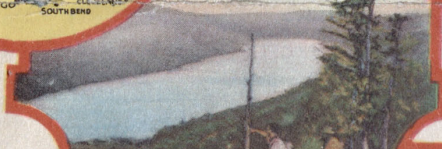
LAKE OF THE CLOUDS, PORCUPINE MOUNTAINS, ONTONAGON COUNTY