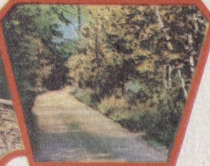
PARADISE TRAIL, MENOMINEE COUNTY