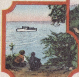
PORTAGE LAKE, HOUGHTON COUNTY