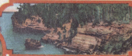
THE PICTURED ROCKS, ALGER COUNTY