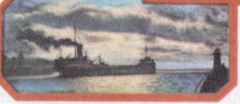
ST. MARY'S RIVER, CHIPPEWA COUNTY © YOUNG STUDIO, 500