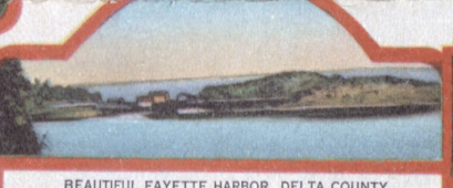
BEAUTIFUL FAYETTE HARBOR, DELTA COUNTY