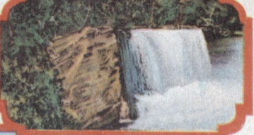
THE LORDLY TAHQUAMENON FALLS, LUCE COUNTY