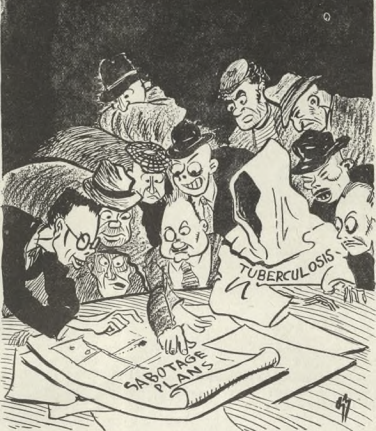
Tuberculosis Will Kill 60,000 Americans in 1942