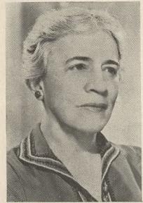
RUTH BRYAN OWEN ROHDE