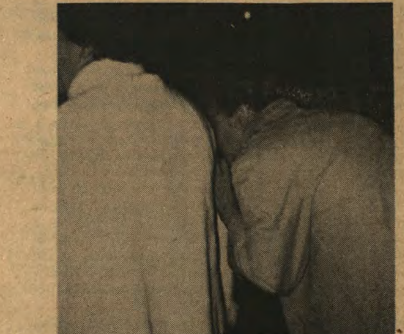
IN RECENT WEEKS THE SPORT OF RED OWL SINGO WAS TAKEN THE AREA BY STORM. PICTURED ABOVE IS ONE LUCKY $20 WINNER IN WHITE PINE, WHO APPARENTLY WAS MADE BASHFUL BY HER GOOD FORTUNE AND THE ATTENDANT PUBLICITY. ANYBODY GUESS?

WHITE PINE SCHOOL MENU - MAY 17-21 Monday - Pizza, corn, chilled fruit, bread/butter/milk. Tuesday - Lasagna, green beans, chilled fruit, bread/butter/milk. Wednesday - Choice of cream of tomato or chicken noodle soup, choice of peanut butter or ham salad sandwich, carrot stix, chilled fruit, bread/butter/milk. Thursday - Beef roast/gravy, whipped potatoes, vegetable, chilled fruit, bread/butter/milk. Friday - Oven fried fish stix/tartar sauce, Fr. fries, sliced tomatoes, pickled beets, jello/topping, bread/butter/milk.