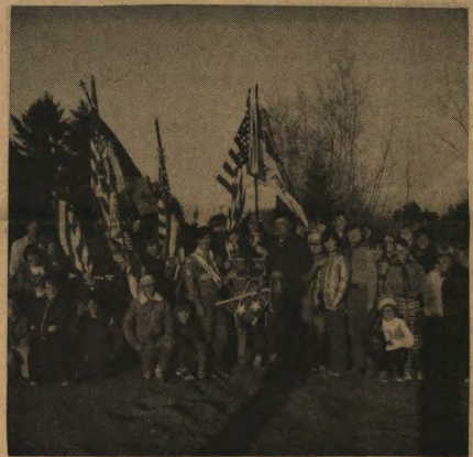
THIS WHITE PINE-ONTONAGON GROUP OF 39 BOY SCOUTS WAS JOINED BY SIX CALUMET SCOUTS ALONG THE ROUTE OF THE FLAG MARCH. THE EVENT IS PART OF THE BI-CENTENNIAL OBSERVANCE.