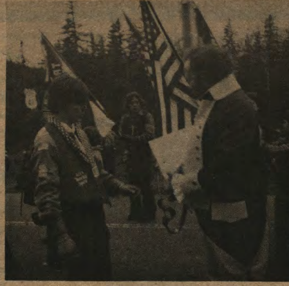
THE OFFICIAL "HIGHWAY 41 FLAG MARCH" AMERICAN FLAG IS ENTRUSTED TO BOY SCOUT TROOP 200 BY AN OFFICIAL OF THE U.P. ORGANIZING COMMITTEE. THE FLAG, ENCASED IN PLASTIC TO PROTECT IT FROM THE ELEMENTS, WILL BE CARRIED FROM COPPER HARBOR TO GARY, IND.