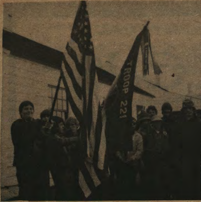
A MEMBER OF THE WHITE PINE BOY SCOUTS TROOP 221 PARTICIPATED AT THE STARTING CEREMONIES OF THE "HIGHWAY 41 FLAG MARCH" HELD AT FORT WILKINS AND COPPER HARBOR.