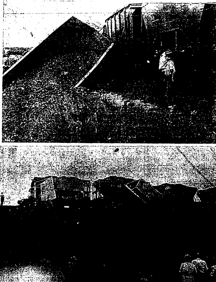
Pictured above is a view of the derailed, which blocked the main line of the L. S. & I. near the viaduct crossing Tool Lake avenue Monday. According to information avail-

able, the accident occurred when the ore cars being pushed by a locomotive struck a "derail", causing the first two cars to leave the track. The top photo shows two boys