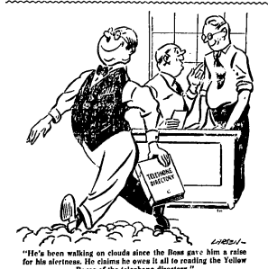
"He's been walking on clouds since the Boss gave him a raise for the telephone. He claims he never it all to credit the Yellow Pages of the telephone directory."