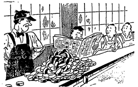
Joe's Hobbies up Production, Inc.—