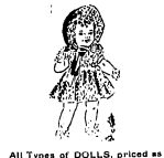
All Types of DOLLS, priced as low as 98c