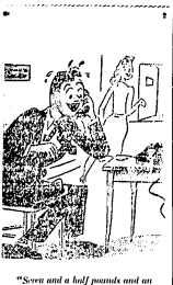
Save and a half pounds and an All-American built Ford!