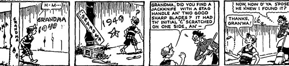
By Charles Kuhn