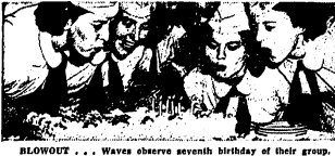
BLOWOUT . . . Waves observe seventh birthday of their group.