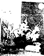
General Health School of Nursing, has been employed at the Lapeer Hospital. The groom is associated in business with his father in South St. Marie, where the newly weds will make their home.