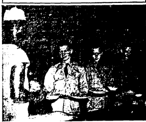
There's plenty of good, wholesome food at every "show down" period for Naval Aviation Cadets in training at Pensacola Naval Air Station and second is always in order. Pensacola Naval Air Station, the "Annapolis of the Air." The focus of the recently reactivated Naval Aviation Cadet training program, which is open to boys being over 16 and under 23, is for the next two years of college. Upon graduation they are commissioned ensigns in the Naval Reserve, or second lieutenants in the Marine Corps Reserve, and awarded their wings and assigned to two years' active duty.