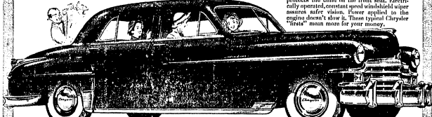
SEVEN PASSENGER 4 DOOR SEDAN with Power Top and Power Windows—also with lighting

Over 50 common sense advances that give you more for your money in safety, performance and comfort.