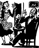
"The promotion came through, Dad. No, I'm not excited!"

Make It A Habit To Join The Crowd Here You must be 21 or over