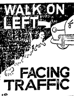
Winner, Fourth National AAA Traffic Safety Poster Contest.