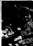
VITAMIN C . . . This is a standard type of vitamins from Florida, showing a Florida beauty surrounded by Florida oranges. Here, however, the beauty, Sleep Nise, Calif., is only four years old.