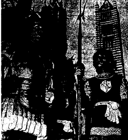
CHEVALRY IS NOT DEAD . . . These elaborate looking gentlemen are some of the boys from Rome, medieval city of Italy, which originally recalls the good old days from every year by reverting to its heavy clothes, customs and habits. His feature on these occasions in the "Pala di Siena," a medieval horse race through the city's square.