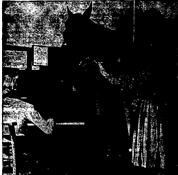
HOBBING AROUND IN SCHOOL . . . A child without a home would feel out of place in England's most unusual educational institution. Wings sailed at Fairford. The family ladies pupils to help their parents or homes in school in the belief that cooperation between child and animal develops self-confidence. This may be developing something—maybe primitive—as it leaves in Dean, London, today.