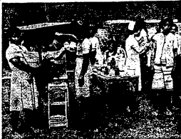
CHINESE BRINGS THE WORLD . . . These Filipinos are getting all cheering Americans. Contributions from churches in every state in the U.S. are being collected. They will be used to fund the drugs, instruments and other medical supplies used at the clinic.