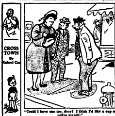
CROSS TOWN By Fred Co.

"Could I have one too, dear? I think I'd like a cup of coffee myself."