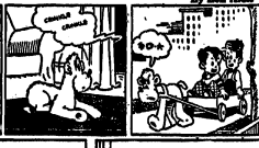
By Len Klein

YOU CAN'T GET IT! YOU CAN'T GET IT! YOU CAN'T GET IT!