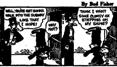
By Bud Fisher

WELL, WHERE HIT-DARN! INTO THE CORNER LIKE THAT! (HOOP!) HOOP!