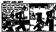
MUTT AND JEFF

ON YES MAN—VC OFTEN HAVE IT AS TOUGH AS THIS AT HOME!