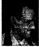
BURNED UNDER FIRE... Several bodies, most coal black...