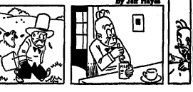
MOOD By Jeff Hayes

WHY ARE YOU NOT HERE? WHY ARE YOU NOT HERE? WHY ARE YOU NOT HERE? WHY ARE YOU NOT HERE?