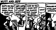
MUTT AND JEFF By Bud Fisher

I AM AN IDIOT FOR THE PAST—AND I'M PLANNING TO STAY THAT WAY WHY HELLO, SLIMBO! I'M SUPPLY JUST AS I AM! DURING THE HIGH season it is a custom for condensed milk, upon receiving the order, to be packed in a special man who used to hang them.