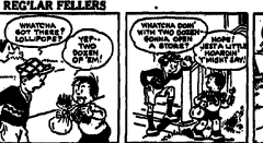
REGULAR FELLERS By Gene Byrnes

WHY ARE YOU NOT HERE? WHY ARE YOU NOT HERE? WHY ARE YOU NOT HERE? WHY ARE YOU NOT HERE?