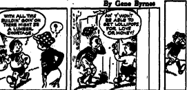
VIRGIL By Len Klue

WHY ARE YOU NOT HERE? WHY ARE YOU NOT HERE? WHY ARE YOU NOT HERE? WHY ARE YOU NOT HERE?