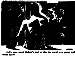
Jeff once found Redford's and to him the world was young and warm again.

"WHERE the matter with you this time? You never see the man. You never see the man. You never see the man..."