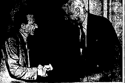
FRIENDLY FOREIGN RELATIONS... Premier Abdo al Ghaizal of Iraq...