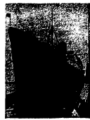
BACK IN CIVILIAN DRESS... Recovered in her former attire...