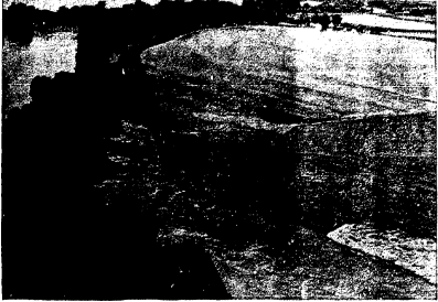
"OLE MISS" SMASHES ANOTHER LEVER. — Bouncing flood waters of the Mississippi crashed through the Chinese Mill Dam across from St. Louis, smashing 2,000 acres of farmland on the Illinois side of the river. Heavy rains reached the Mississippi in an almost record speed at St. Louis as soldiers and volunteer workers labored mightily to hold the remaining levees together.