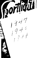
"I don't know. I don't know. I don't know."

"I don't know. I don't know. I don't know." "I don't know. I don't know. I don't know."