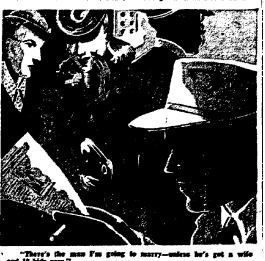
"There's the man I'm afraid to marry—mine's got a wife and six kids now."

"There's that man I'm afraid to marry—mine's got a wife and six kids now." "A wife with that man, of course? What?" "That's not all. I'm trying to see if I can't get a divorce from her. I'm trying to see if I can't get a divorce from her."