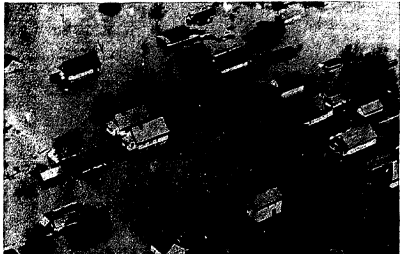
FLOODS SWEEP NATION . . . Typical of road work in history is the Ensign, Wash. Road which resulted in the state capital of Washington. Flood conditions were common in many parts of the nation and resulted in millions of dollars in property loss. Many farming regions were flooded, crop loss as well as loss to farm buildings, equipment and livestock was extremely heavy in several states.