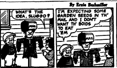
By Ernie Bushmiller

"I'M EXPECTING SOME SARDINES HERE IN 'T'! AAK, AND I DON'T WANT 'T' TO EAT 'T'!"