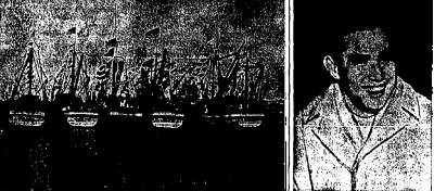
BLESSED PISHING PLACE . . . Among the many notable catches obtained in St. Augustine, Fla., about 100 miles in the country, is the traditional blessing of the fishing boat each year on Palm Sunday. More than 100 boats, anchored in Daytona Bay received "Lies Paradise" the ancient religious blessing which came to the new world from the fishing villages of Normandy and Brittany. This fact is part of the best receiving the blessing.