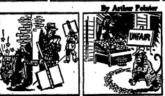
By Arthur Pooker