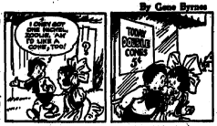
By Cass Bryner