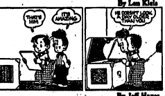
By Len Klein