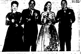
WIN THESE OILS... Pledge those big four winners to the 30th annual assembly award program at Los Angeles...