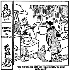
CROSS TOWN By Roland Cox

"No he ain, we only sail 'em straight, we don't rattle say!"