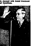
NEW GOVERNOR... Oscar Rennebohm as he was sworn in as governor of Wisconsin...