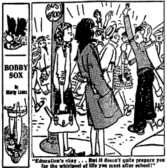
BOBBY SOX By Roy Lee

"No he ain, we only sail 'em straight, we don't rattle say!"