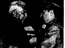
U. N. BUDE FOR JAPAN... From the problem of occupation of Japan...