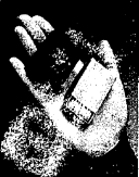
SMALLER CAMERA... Built and designed for use by GDS agents and authorized personnel during World War II...