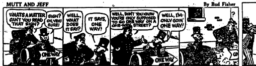
MUTT AND JEFF

"WHAT'S AMATED, CANT YOU SEND THAT SIGN?"