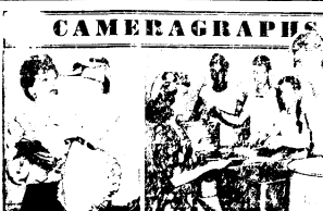
Members of the Common Council of the City of Negamoon at a recent meeting.