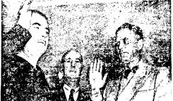
Baschal states of another... baschal states of another... baschal states of another...