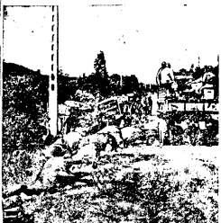
On the road to Harrogate, Chertsey automobile wreckage... dead lives and other equipment is strewn the road after... the wreckage of the Allied troops which followed in the advance at Chertsey. An American tank advances down the road.