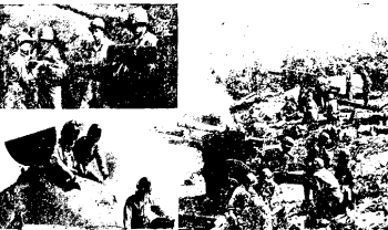
These pictures show the final phase of the first term training at West Point before graduation when the cadets become second lieutenants and enter active service. In picture at upper left two cadets enter the... West Point... West Point... West Point...