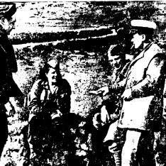
A British Royal Air Force officer, who is operating with the Partisan forces of Marshal Tito in Yugoslavia, offers a cigarette to a Partisan woman partisan. It was revealed recently that the only RAF force are working with the Partisans.