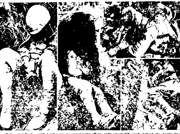
Exhausted Yanks each week, an opportunity offers, only about 200 yards below the battle line in Italy. Even big guns don't work any longer and snipers while their bullets rain down on the front line.