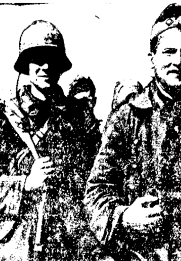
These two Nazi soldiers, captured from the last near Carrozzio, Italy, were also seized by the capture of an allied tank. They were completely unharmed at being taken prisoner, the party only loudly for the cameraman. Or perhaps at this pleasure at having been captured.