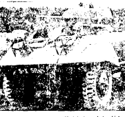
This is the armoured M. Half-track model which combines an all-terrain army's remarkable maneuverability. It is designed to transport troops and equipment over rough terrain. It is equipped with a 37mm anti-aircraft gun and a machine gun.