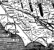
In the most devastating aerial assault in history Yank bombers destroyed Cassino, dropping more than 2,500 tons of bombs on the town. This record weight of explosives was concentrated in about 100 separate raids. Heavy guns finished the job. Then ground troops moved in. While this was taking place, RAF planes attacked the Nazis at Anzio.