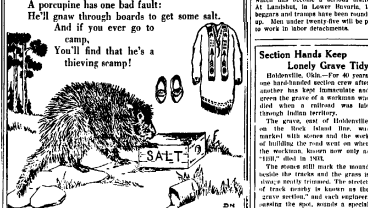
By the Staff of the National Co-Operative

A porcupine has one bad fault: He'll gnaw through boards and get some salt. And if you ever go to camp, You'll find that he's a biting ramp.