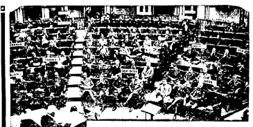
Scene in the house of representatives in Washington during a session of the Interparliamentary union's twenty-third annual conference, attended by distinguished men from many countries. Secretary of State Kellogg is in the foreground.