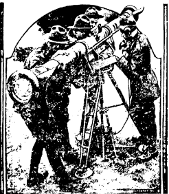
Members holding of the Infantry, the better-aimed soldier, accompanied guide to locate the target and holding in the exact range for the gun. This and other new devices were demonstrated at the recently concluded meeting of the Army Ordnance Association, and other organizations interested in firearms and defense.