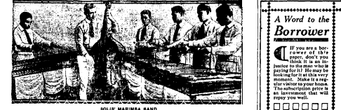
SOLIS MARINIA BAND At High School Auditorium, Monday Evening, October 11.