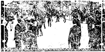
This is the first photograph in which America's flag is seen in the streets of Vienna which was raised by the commanding forces of the British command.