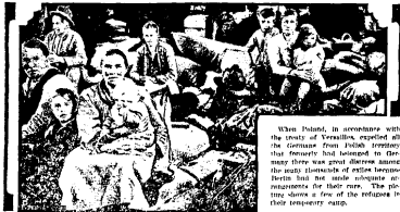
When Poland, in accordance with the terms of Versailles, expelled the Germans from Polish territory the mass flight of refugees to the west was great. Above, the mass flight of refugees to the west, at Puchow, Poland. Below, the flight of refugees to the west, at Puchow, Poland.