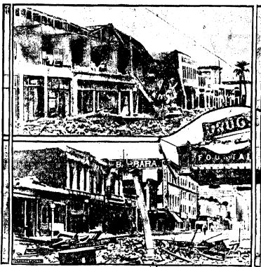
These pictures, transmitted by American Telegraph and Telephone wires, show the extent of Santa Barbara, Cal., which was destroyed by the earthquake.