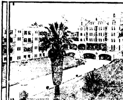
The famous Arlington hotel at Santa Barbara, Cal., that was wrecked by the earthquake shortly after destruction of that city.