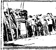
One of America's oldest and most interesting ruins, one 1200 years old, was restored in the Pueblo of Nevada on background for a historical museum. The picture shows a part of the overgrown "ruin" which was rebuilt by field laborers brought from New Mexico.