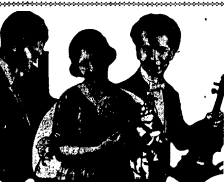
BETTY BOOTH CONCERT COMPANY

The final entertainment in the best of music and song... The concert will be held at the Negaunee Hall.