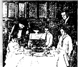
Fruits and Vegetables Are Necessary for Family.