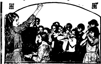
Students are well at their instruments, the results of which has been to give them the pleasure of playing the mouth organ orchestra.