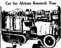
Recent arrival of the famous African motor car, which will be used for research in Africa.