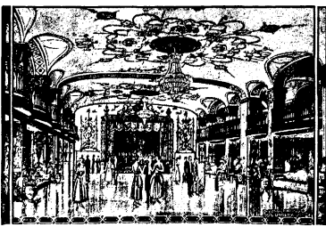
Architect's sketch of the beautiful ballroom in the new Mayflower hotel in Waukegan which will be the scene of the charity ball March 4. It will take the place of the usual official ballroom ball and will be in charge of a group of prominent men and women of the capital city.