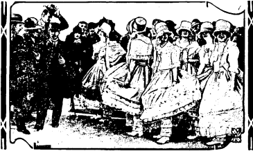
Here are shown the members of the chorus of the British revue "Vivian la Veuve," which is expected at Monte Carlo recently. When the girls wish to make an appearance on the terrace, the police literally "chase" them off.