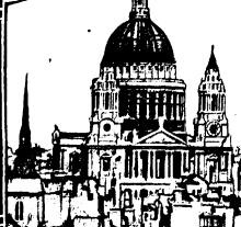
The great dome of St. Paul's in London has been discovered to be in a condition because of the weakness of the right big stone that supports it. The public is to be asked to contribute $100,000 to carry out the necessary repairs.

Photograph of St. Paul's, here found unsafe of Chicago, who recently received their war debt, according to reports. They claim there has never been a close check between.