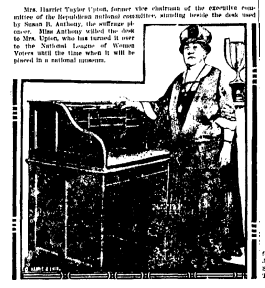
Prized Relic for Women Voters

ek was to convey Kvi at, es her way to th