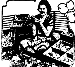
In order to keep a record of their hatchlings, poultry raisers are tagging their chicks as they are hatched. The smaller variety of California hen hatches the first chicks in western California. A number of hens are hatched in the State of California.