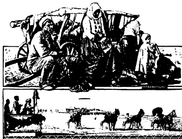
How is an example of the starvation in Soviet Russia. One photograph shows a trotting race on the track at Moscow by the Bolshevik government. The other shows a starving filly in the hands of the Red Guard for sale.