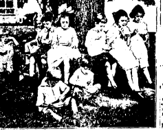
It is "Warty" When You Have the Cream and Caca-Any Child Knows