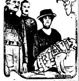
Stubby, the Italian Dog, has become the mascot of the American Expeditionary Force in France. He was decorated with the Distinguished Service Cross by General Pershing for his bravery in the battle of Meuse-Argonne.

Washington, D. C., Dec. 10. — General Pershing has decorated General Stubby with the Distinguished Service Cross.