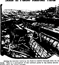
Among the broken boxes in the East in eastern Colorado were the rails of the Pueblo railroad yards.