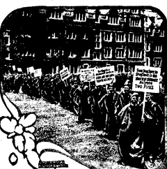
"Anti-Violetism" was the slogan of the 5,000 mob, representing 65 classes of the University of Pennsylvania, who gathered on the college grounds for their annual protest against violetification.