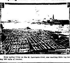
Early spring view on the St. Lawrence river, now mounting high up to the 500 feet in height.