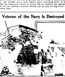
Photo showing the burning of the naval intelligence ship Cyclops when in the States at New York. The vessel was commissioned in the U. S. Navy in 1915, was in service in the West and South American seas, and was used as a covering ship during the World War.