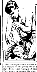
A young boy, known as the Alligator Boy, holding a large alligator. The boy is a man of 10 years of age. The alligator is a large animal of 10 feet in length.