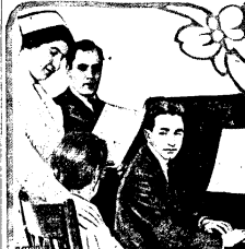
Music Hath Charms for Insane