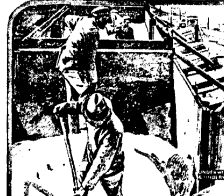
German Potash Salt for America

German Potash Salt for America. A photograph of a man in a suit standing in a room. He is looking towards the camera.