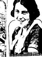
"I'M NOT A PRODIGY"

"I'M NOT A PRODIGY". A photograph of a man in a suit standing in a room. He is looking towards the camera.