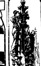
THEY'RE IN THE AIR

Music Hath Charms for Insane. A photograph of a man in a suit playing a piano. He is looking towards the camera with a slight smile.