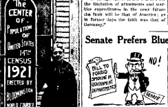
The CENTER OF POPULATION OF THE UNITED STATES IN 1921, AS DETERMINED BY THE BUREAU OF THE CENSUS, IS LOCATED AT THE POINT WHERE THE RED LINE CUTS THE GREEN LINE.