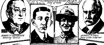
SECRETARY OF AGRICULTURE, SECRETARY OF COMMERCE, ATTORNEY GENERAL, POSTMASTER GENERAL