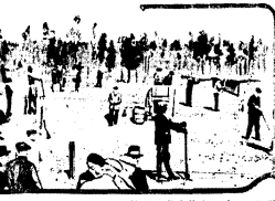
A view of the mid-state trapshooting stand on the famous traps at Pinehurst, N. C. Participants from many counties and sections, 47 in all.