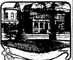
What is said to be the smallest park in the world is located at the foot of the Mount Wilson at Brewster, N. J. It is known as "The Park of the Mountain" and is the only one of its kind in the world.